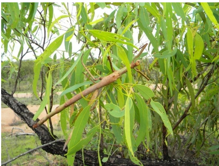
← Stick insect hanging in a tree.

A pair of binoculars will also help you see higher up in the plant.